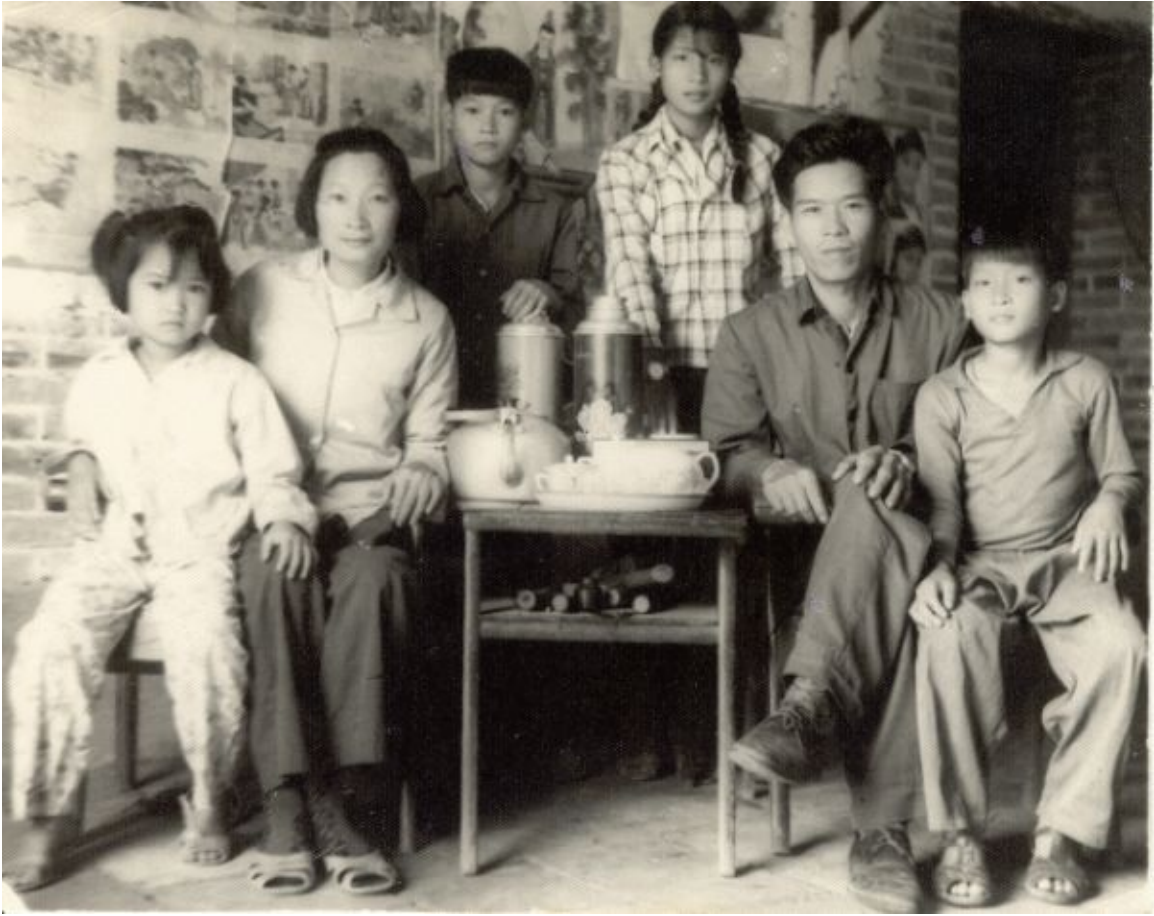
My first family picture taken in 1983. I'm the boy standing in the back.