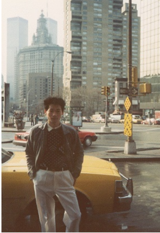
New York City. I spoke no English when I came to America.