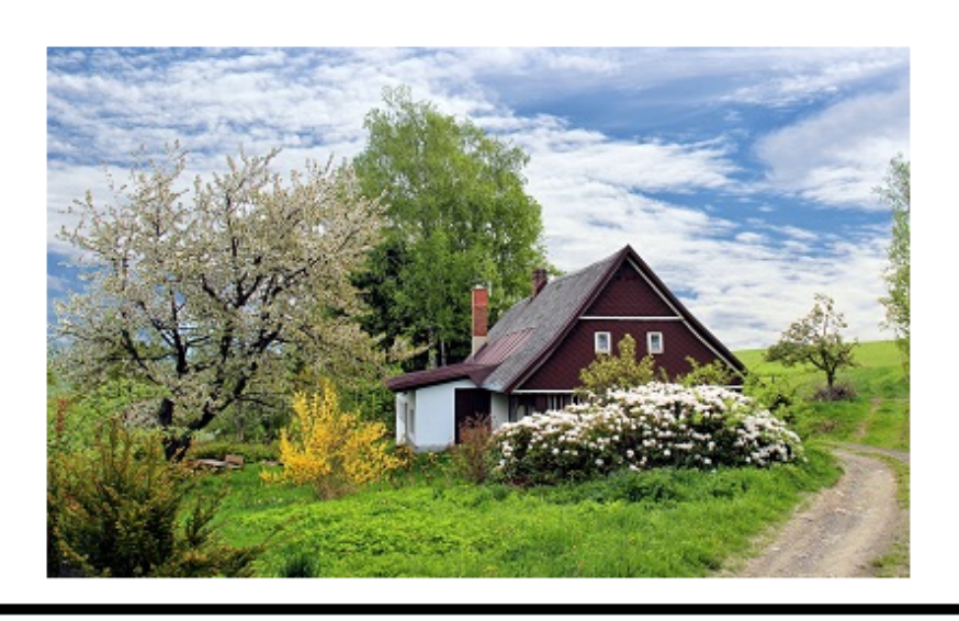
Shadowing # 1: with no text